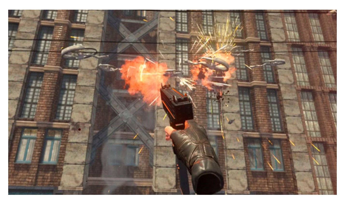
NEW RULES, USE THE ENVIRONMENT!

Use all the elements in the environment in your favor with the incredible gravity gun. You will be able to capture any object in the landscape and launch it against enemies, converting them into a weapon. Your imagination is the limit.