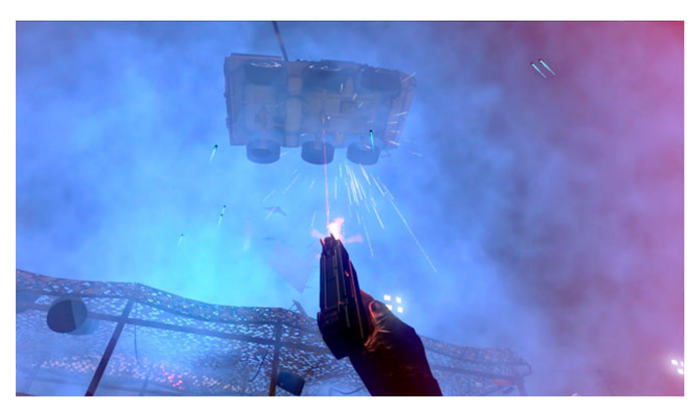
CLASSIC MODE -FOR THOSE PARTICULARLY NOSTALGIC-Pass 6 levels and the final boss, like in the old days. The difference is that now you won't have to use coins for retries. What are you waiting for?