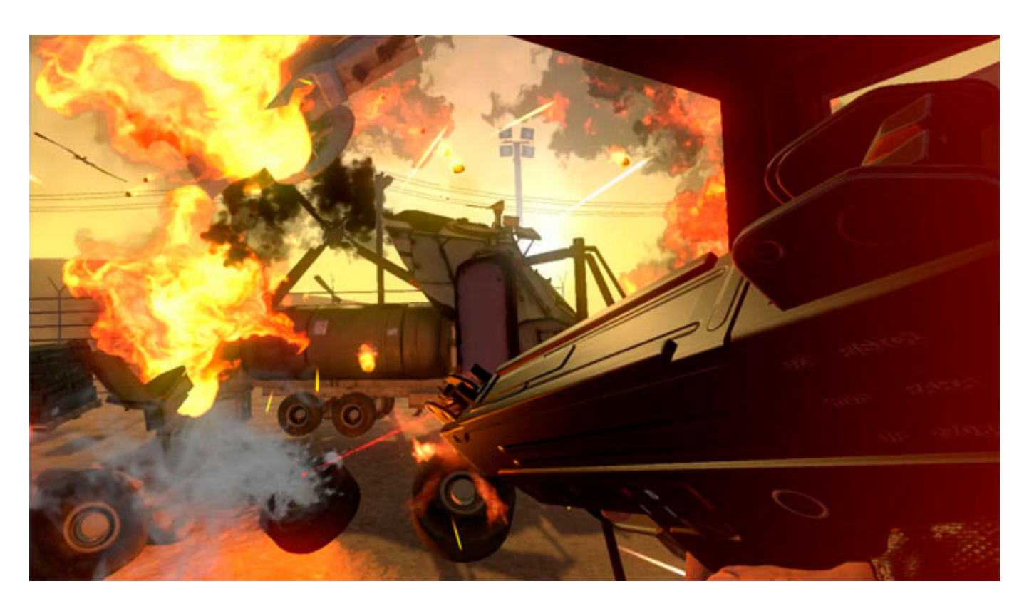
IMMERSIVE MODE -FOR PROFESSIONALS-

Complete 108 missions, 36 levels and many upgrades will unlock, giving you ever more destructive power. Natural anti-stress guaranteed.